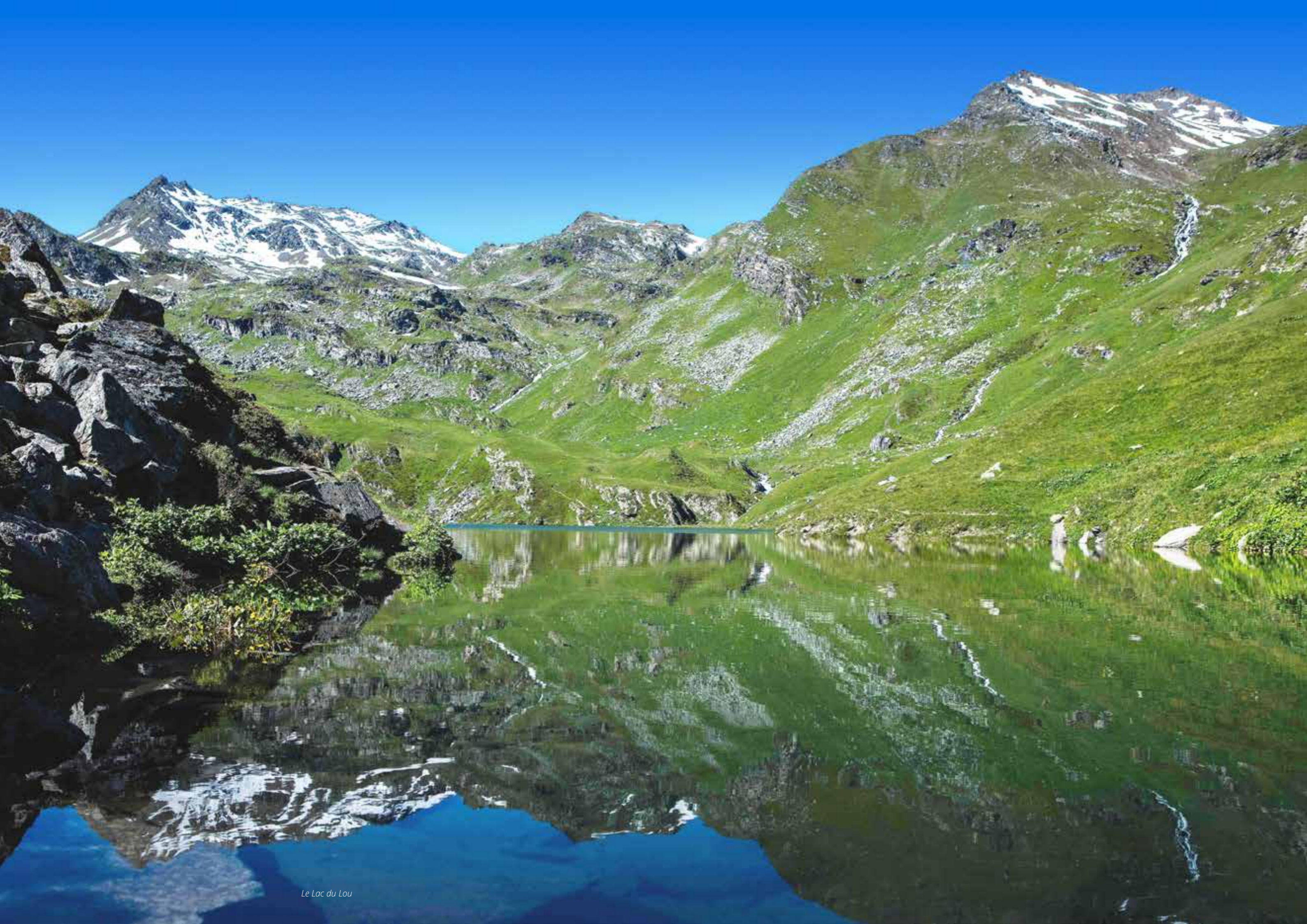
Le Lac du Lou