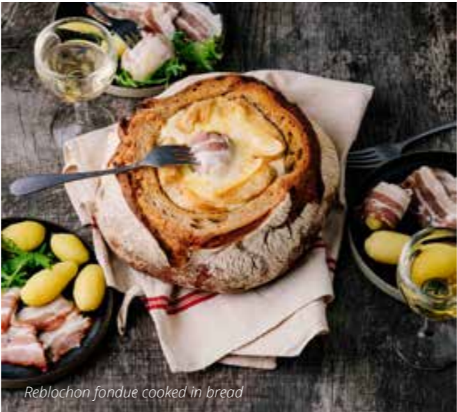
Reblochon fondue cooked in bread