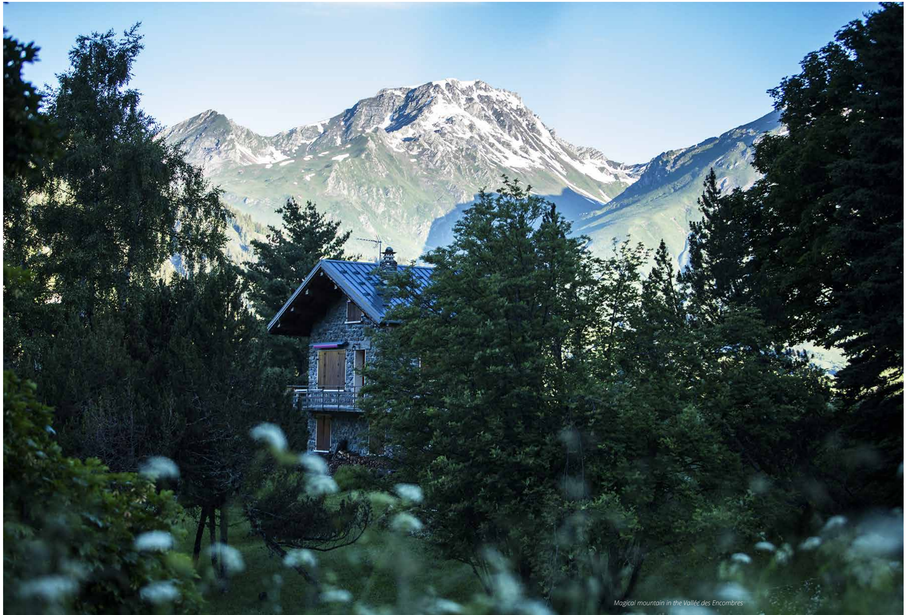
Magical mountain in the Vallée des Encombres