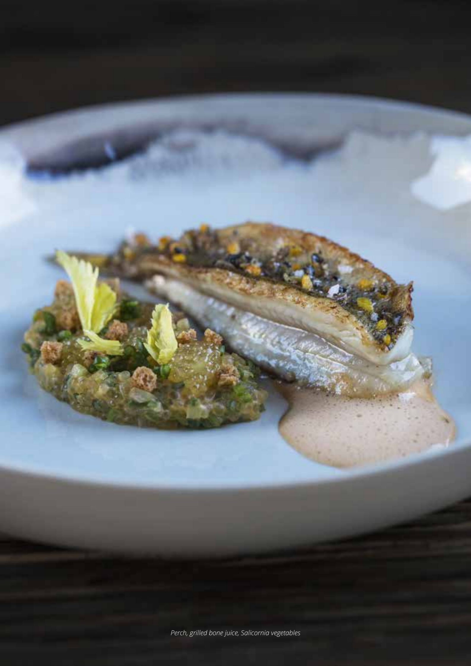
Perch, grilled bone juice, Salicornia vegetables