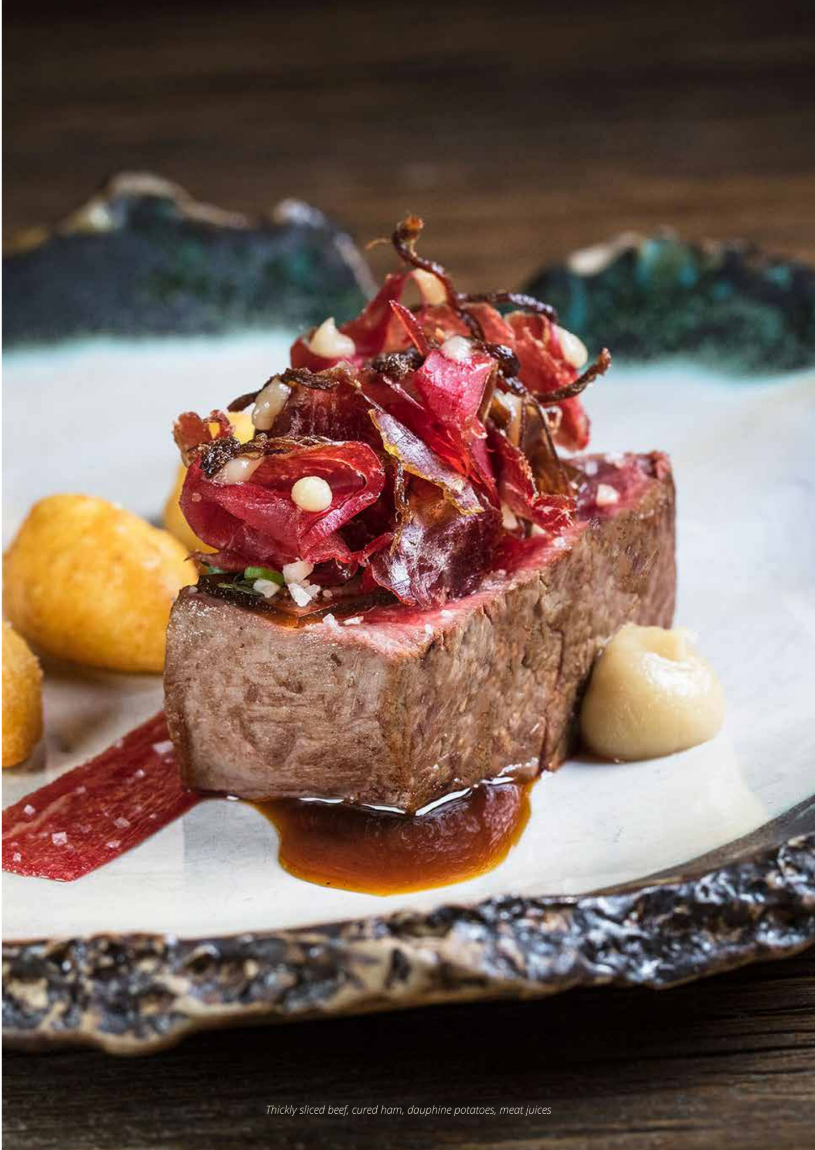
Thickly sliced beef, cured ham, dauphine potatoes, meat juices