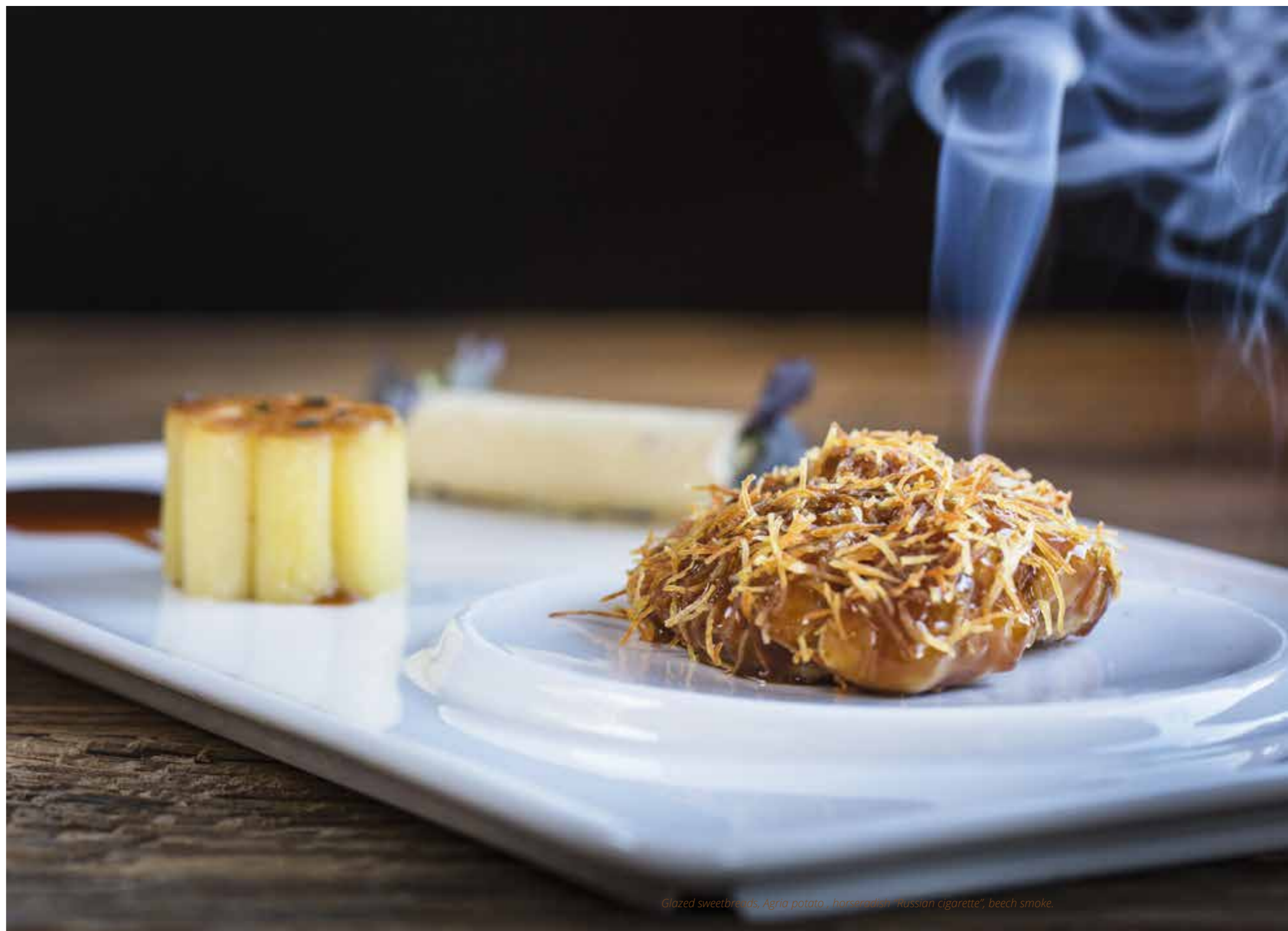
Glazed sweetbreads, Agria potato, horseradish "Russian cigarette", beech smoke.