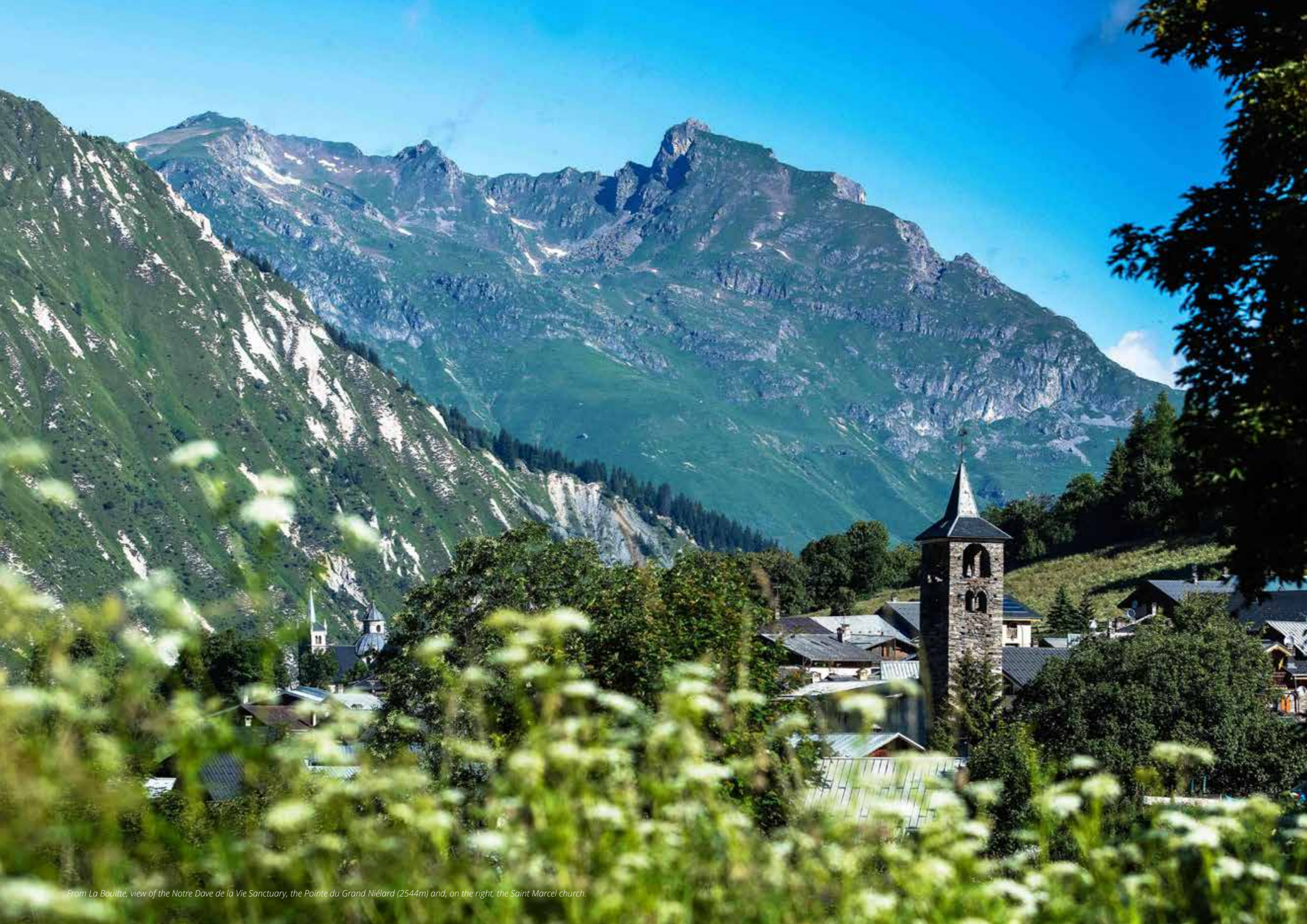
From La Bouitte, view of the Notre Dame de la Vie Sanctuary, the Pointe du Grand Niélard (2544m) and, on the right, the Saint Marcel church.