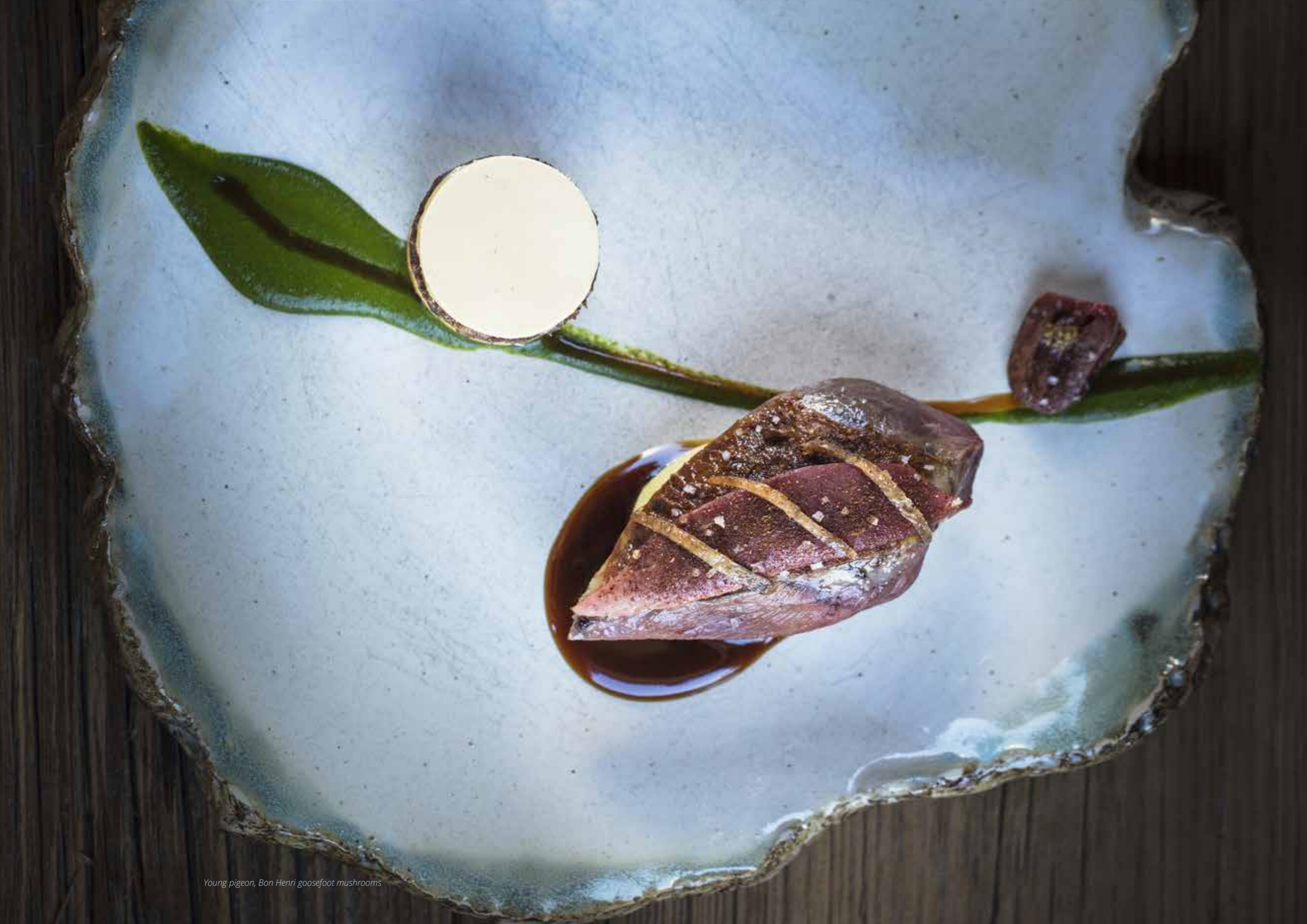
Young pigeon, Bon Henri goosefoot mushrooms