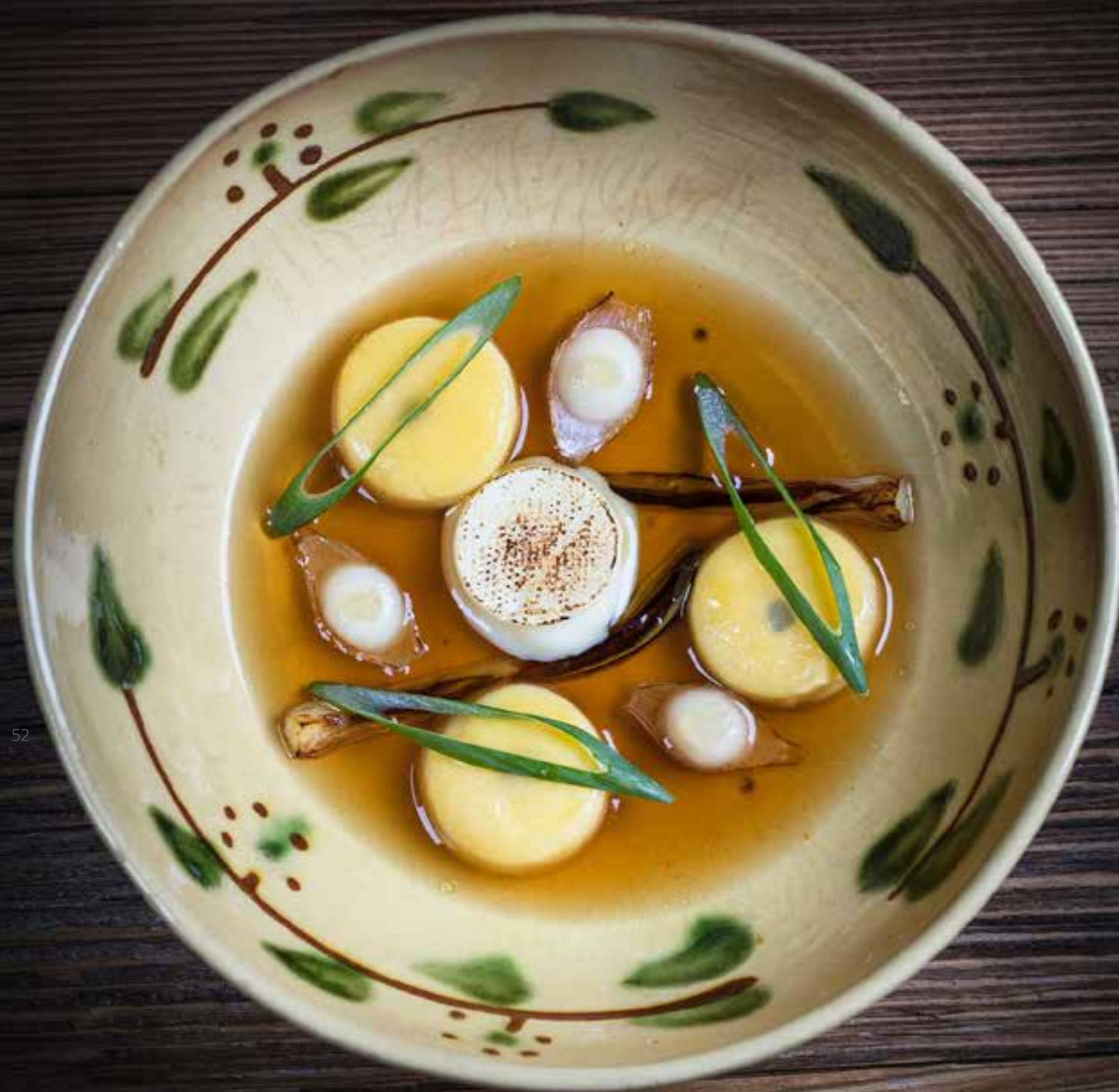
Reblochon ravioli, onion stock, "wheel" chips.