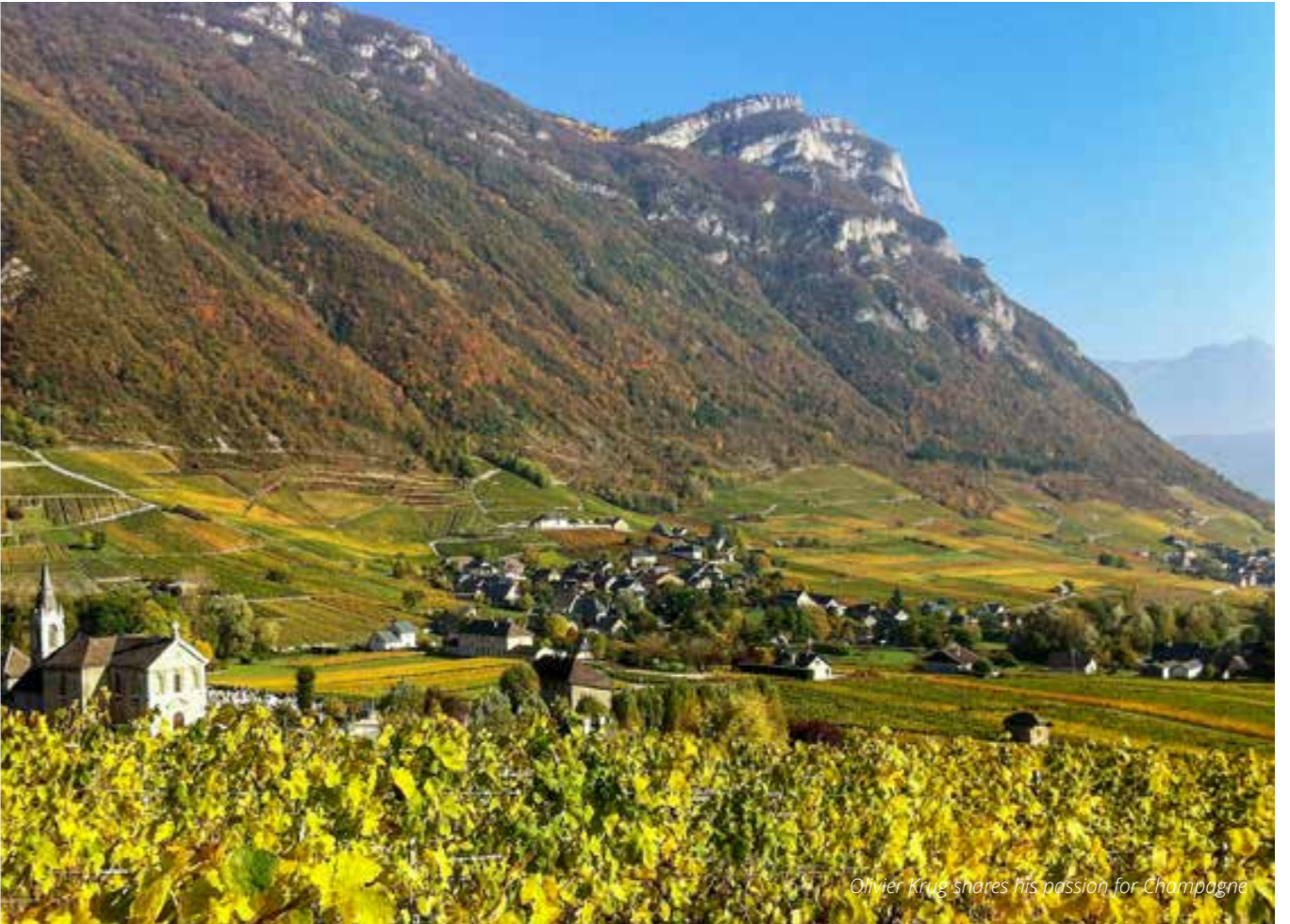
Olivier Krug shares his passion for Champagne

Since winter 2012-2013, La Bouitte has paid tribute to its favourite winemakers and famous wine critics during memorable oenological evenings , with its guests coming from all 5 continents (see page 26).