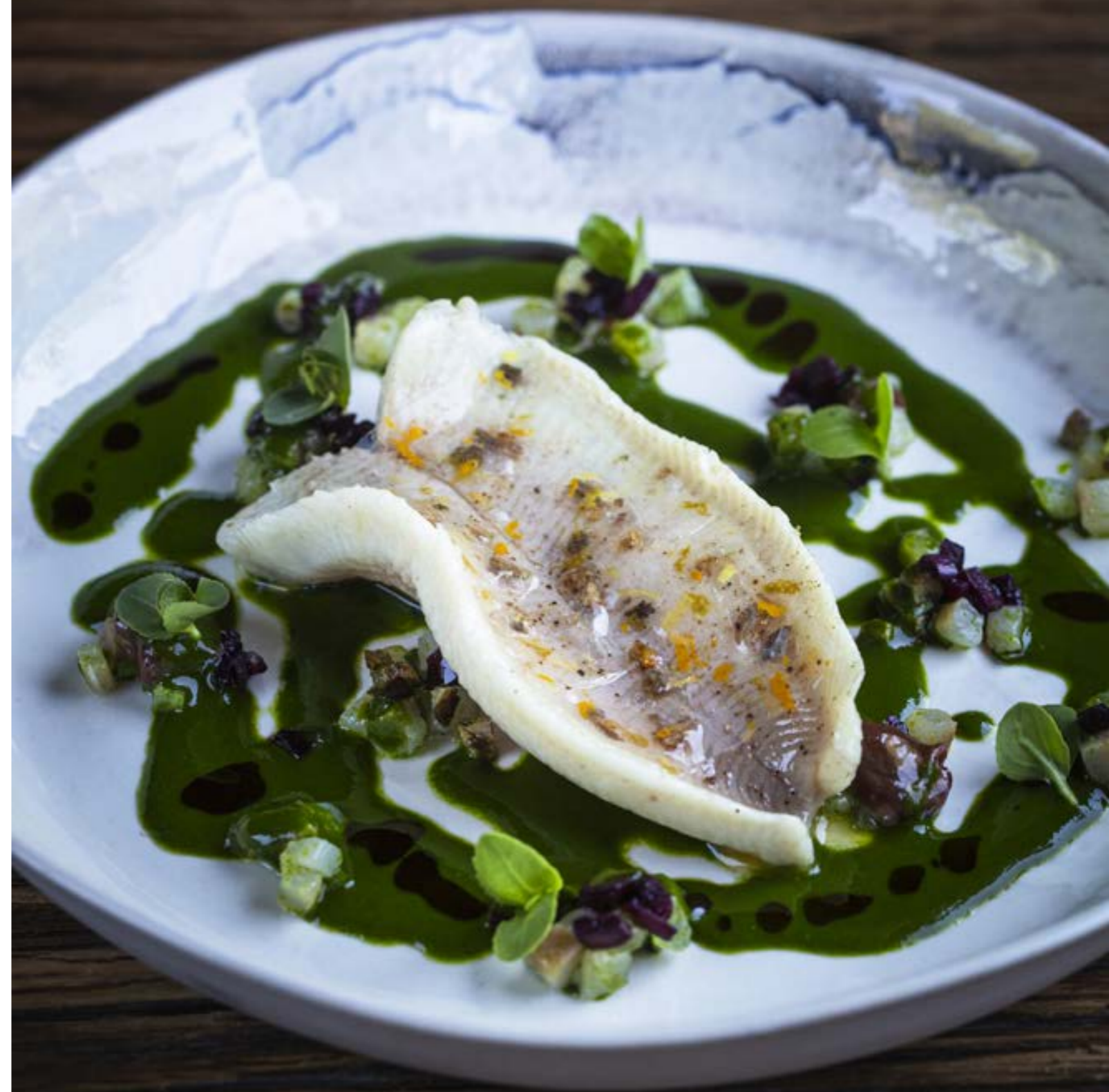
Freshly caught in the stream... Pearly trout, brushed with lemon butter, wild watercress velouté