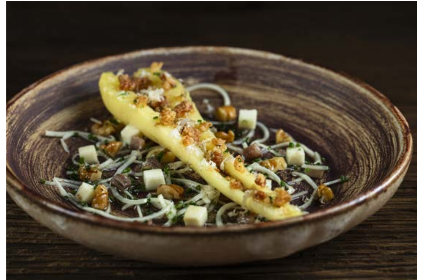
An unloved vegetable, yet so good... Marinated croznes, seasoned vinaigrette