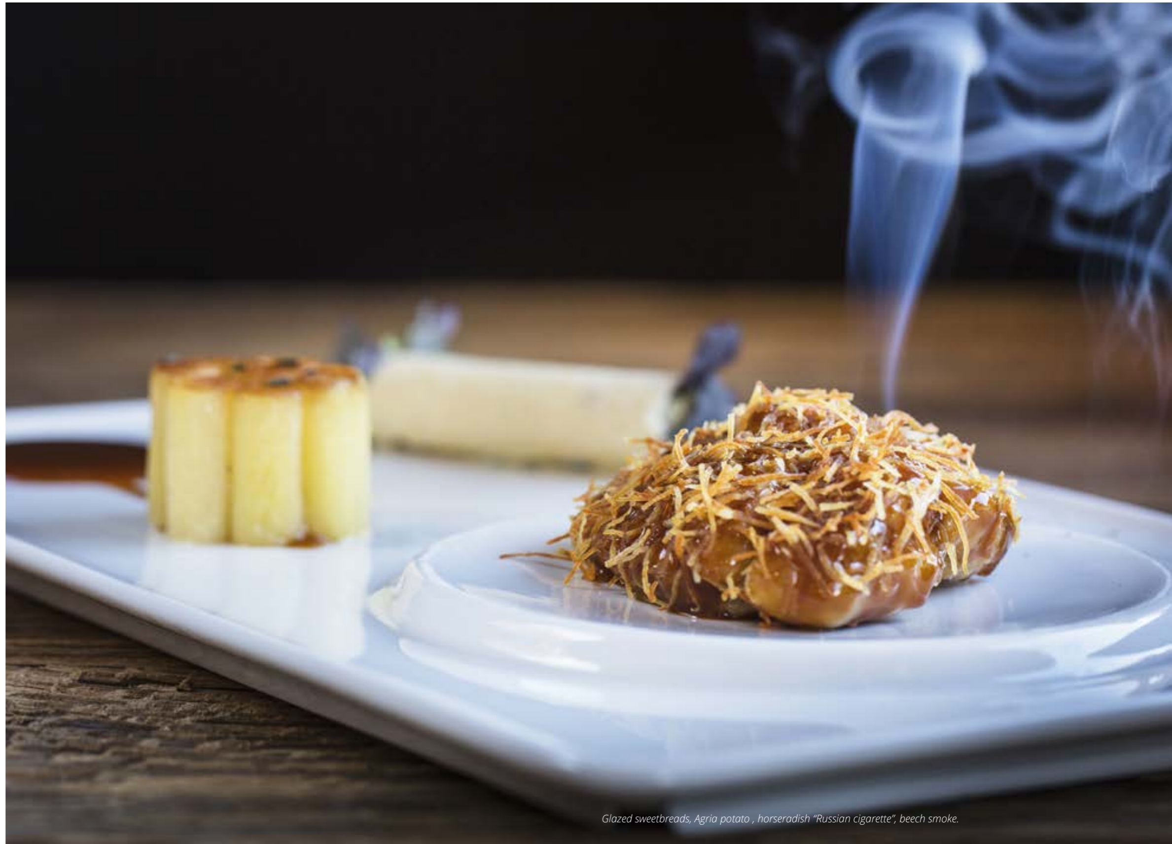
Glazed sweetbreads, Agria potato , horseradish "Russian cigarette", beech smoke.