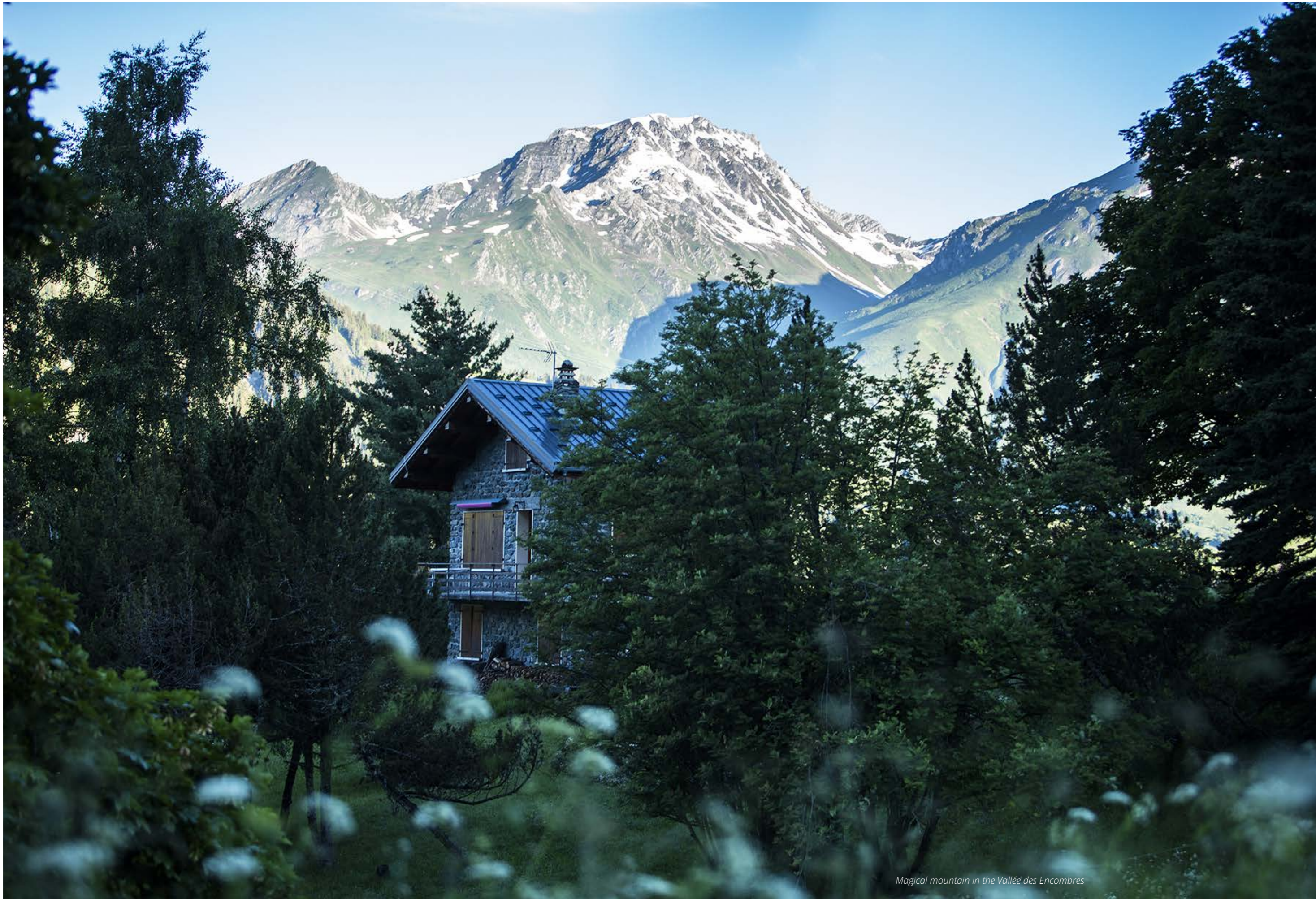
Magical mountain in the Vallée des Encombres