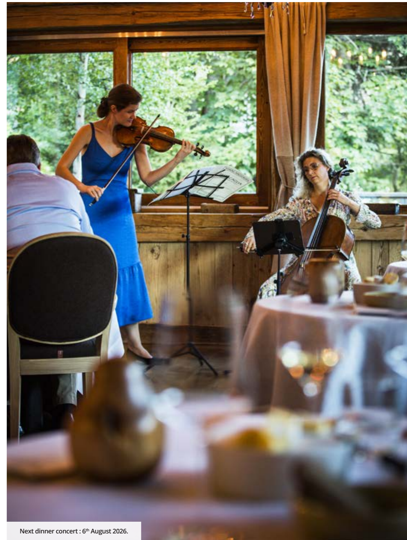
Next dinner concert : 6 th August 2026.