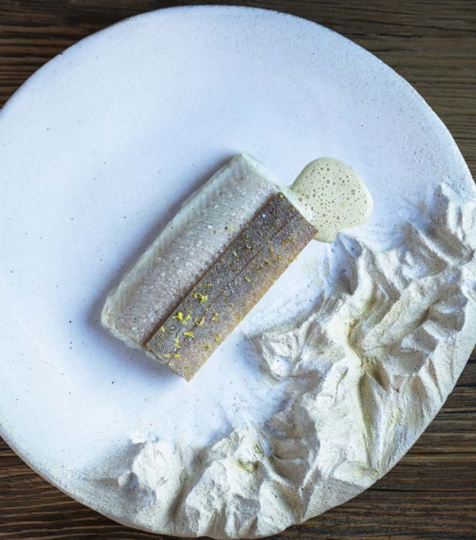
Prince of the lakes... Arctic char, trembling flesh, crispy skin, virgin sauce.