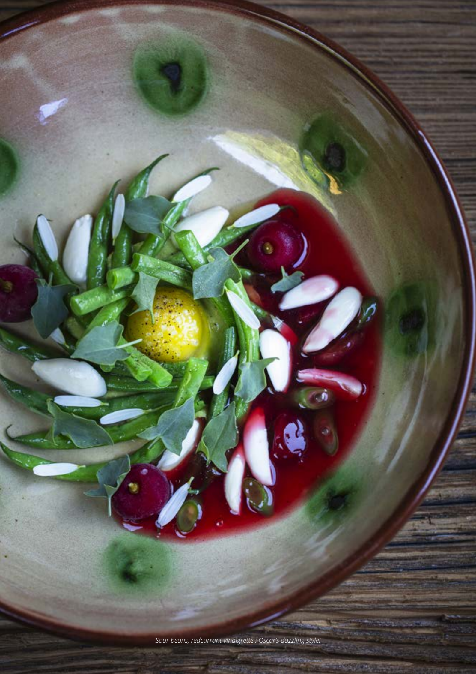
Sour beans, redcurrant vinaigrette : Oscar's dazzling style!