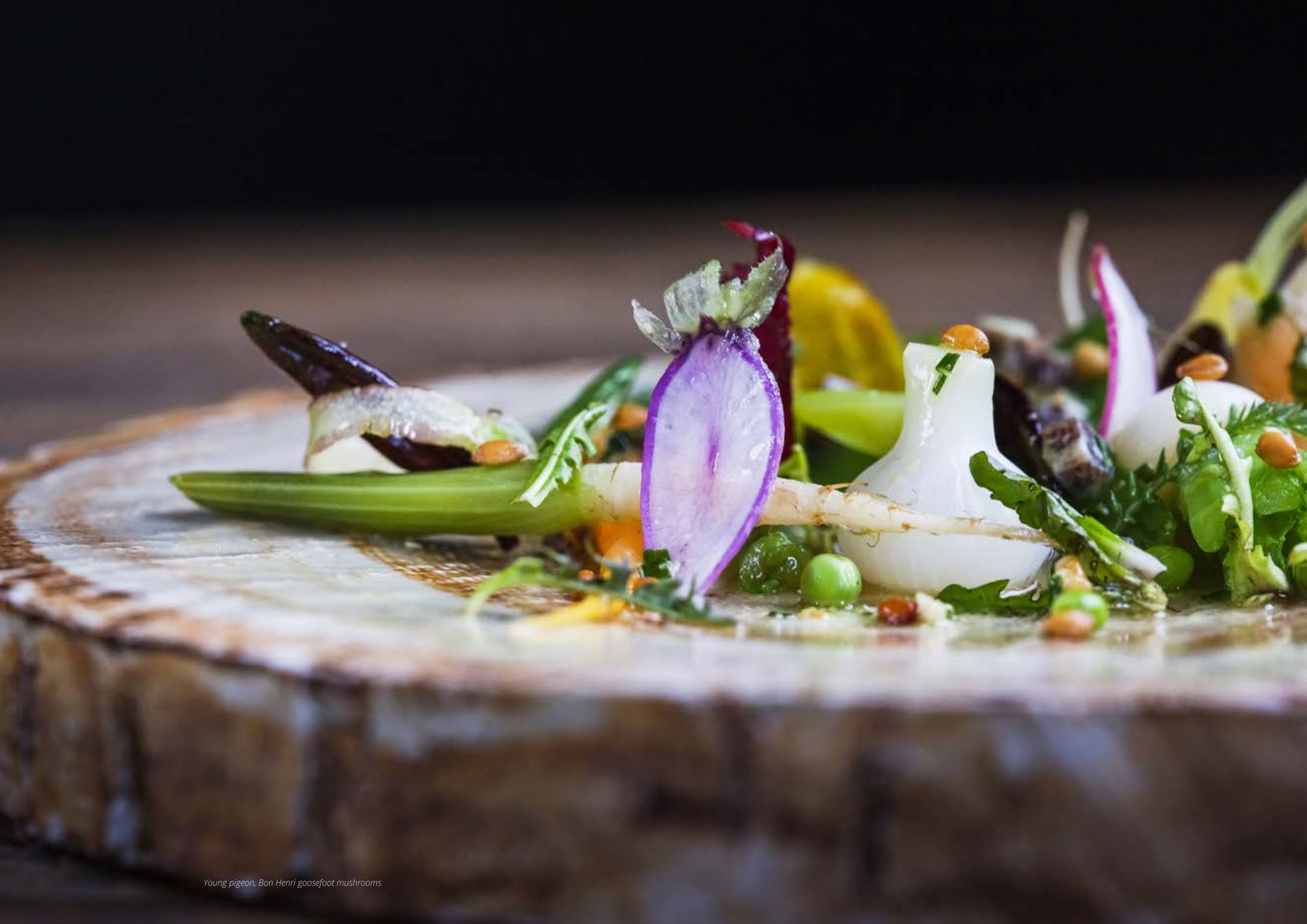
Young pigeon, Bon Henri goosefoot mushrooms