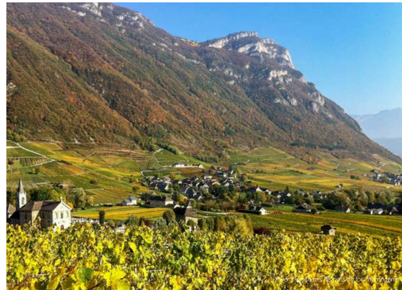
Olivier Krug shares his passion for Champagne

Since winter 2012-2013, La Bouitte has paid tribute to its favourite winemakers and famous wine critics during memorable oenological evenings , with its guests coming from all 5 continents (see page 28).